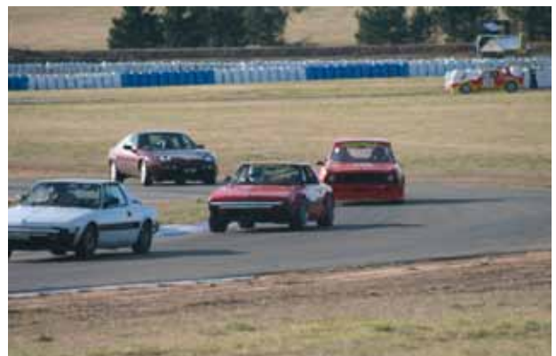
FERRARI CLUB OF AUSTRALIA WAKEFIELD PARK RACEWAY Ferrari Club Australia